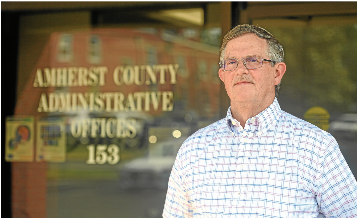
PAIGE DINGLER, NEW ERA-PROGRESS

Amherst County's only hometown newspaper | THURSDAY, JULY 6, 2023 | NewEraProgress.com | Amherst, Va.