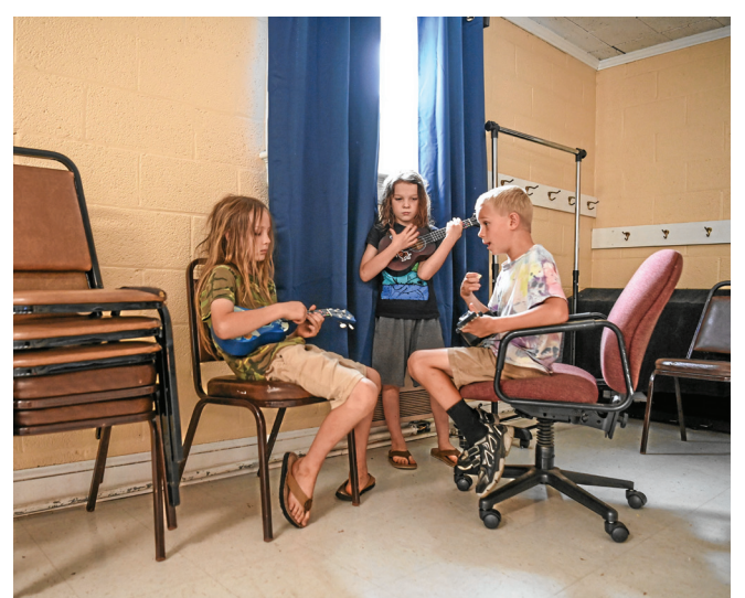
Students practice playing the ukulele during the Ukulele Camp at Second Stage Amherst on Wednesday, July 19, 2023.