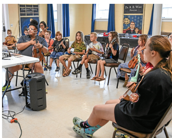
Students play Ukulele during the Ukulele Camp at Second Stage Amherst on Wednesday, July 19, 2023.