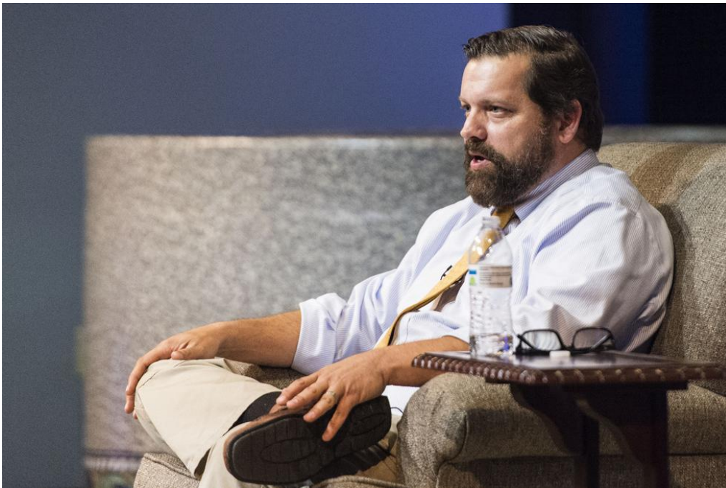
Republican Rep. Tom Garrett of Virginia's 5th District talks during a town hall meeting in Moneta on May 9, 2017.

When she returned home, she said she found Garrett in the car with the engine running and the garage door sealed.