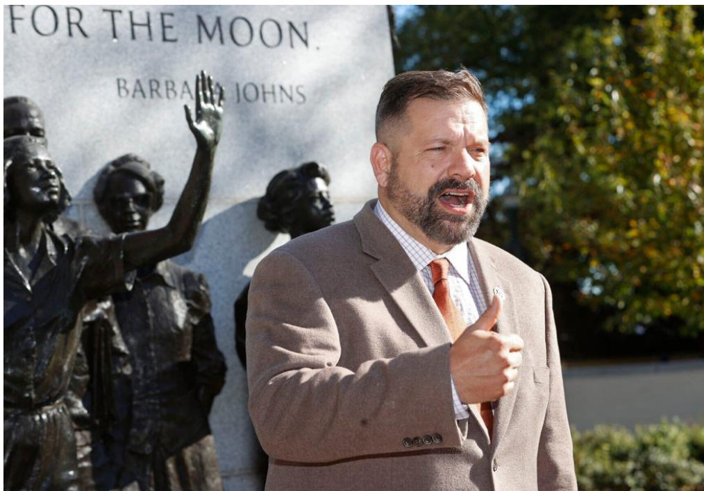
At the Virginia Civil Rights Memorial in Capitol Square in November, former U.S. Rep. Tom Garrett announces his comeback bid for a House of Delegates seat.