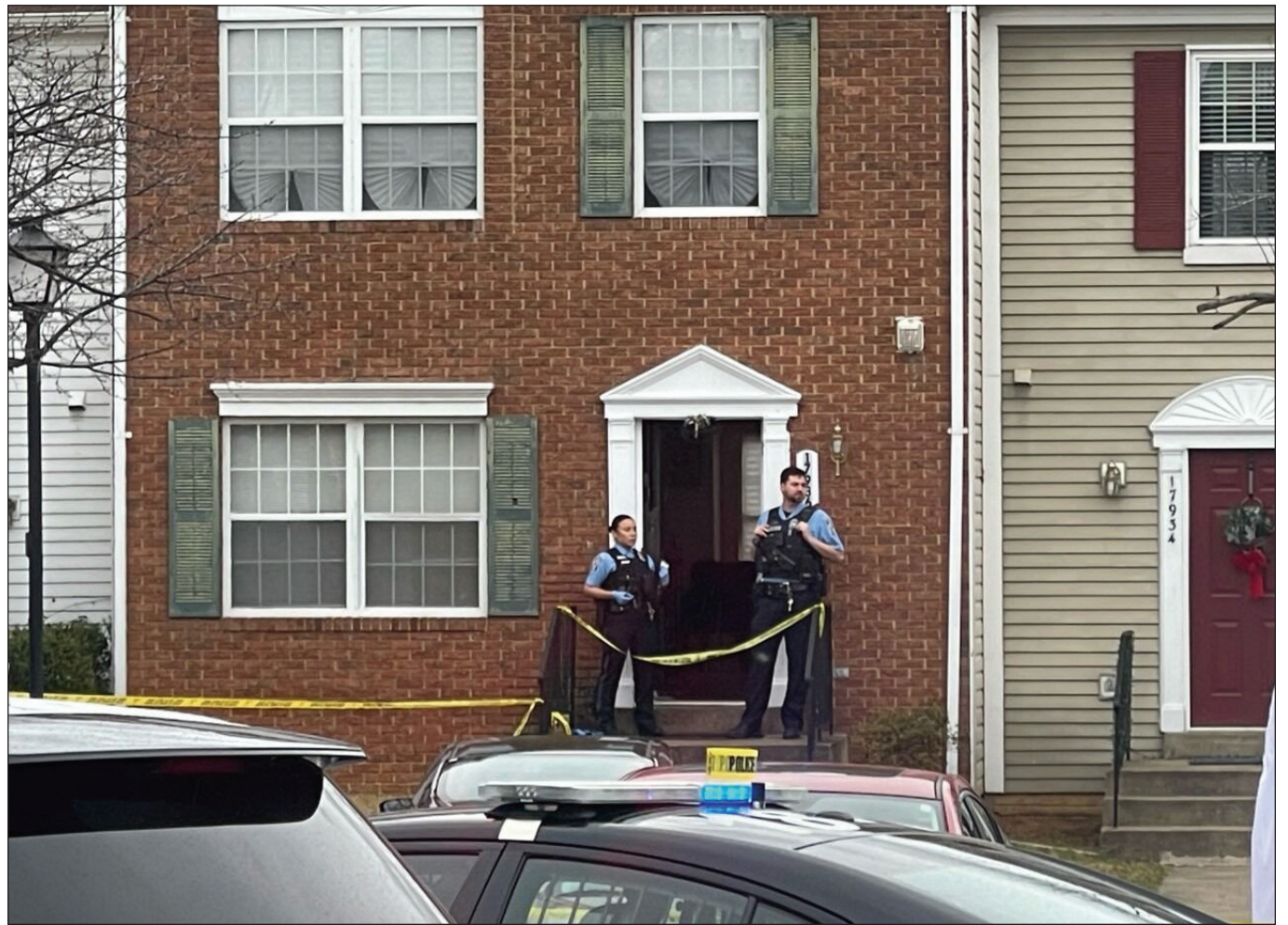
A child was killed and four others wounded in a shooting Wednesday morning in Dumfries.

Phelps called the scene "very traumatic" and thanked first responders for their