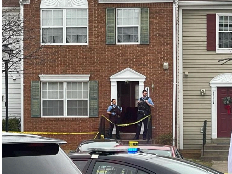
A child was killed and four others wounded in a shooting Wednesday morning in Dumfries.