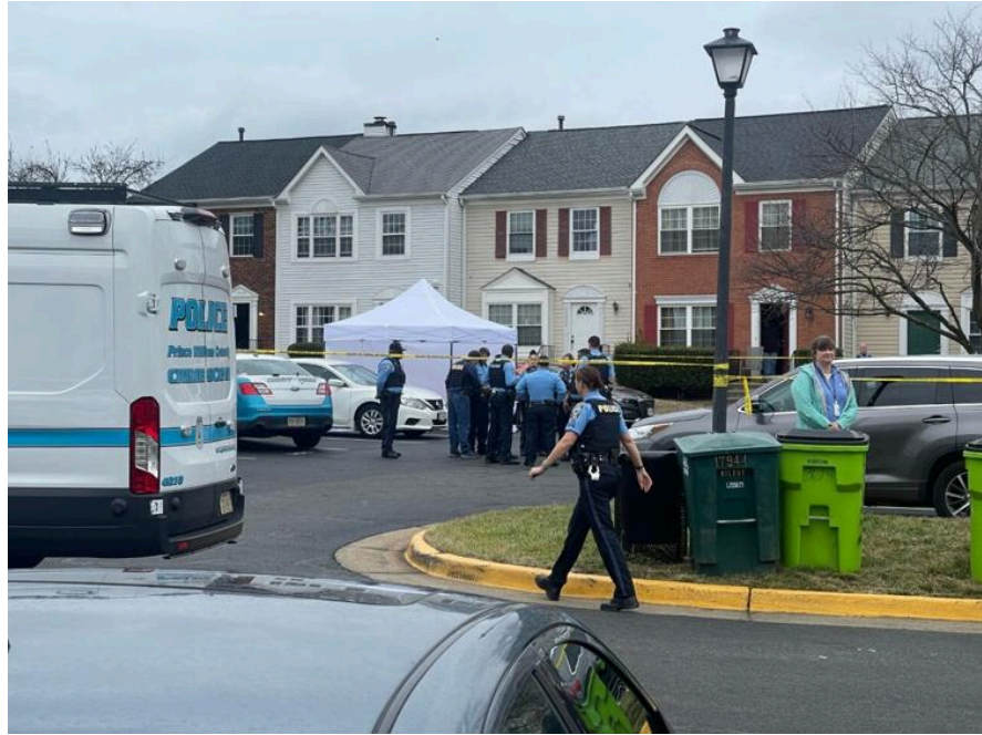
Officers were going door-to-door seeking witnesses in the Williamstown neighborhood Wednesday morning after five people were shot, including a child who died.