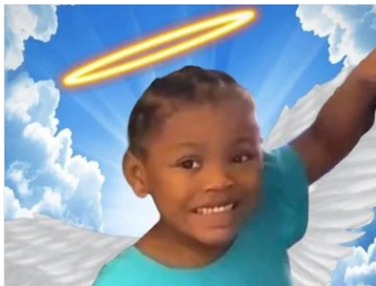
'Unimaginable tragedy': Children shot in Dumfries lost their mom three months ago