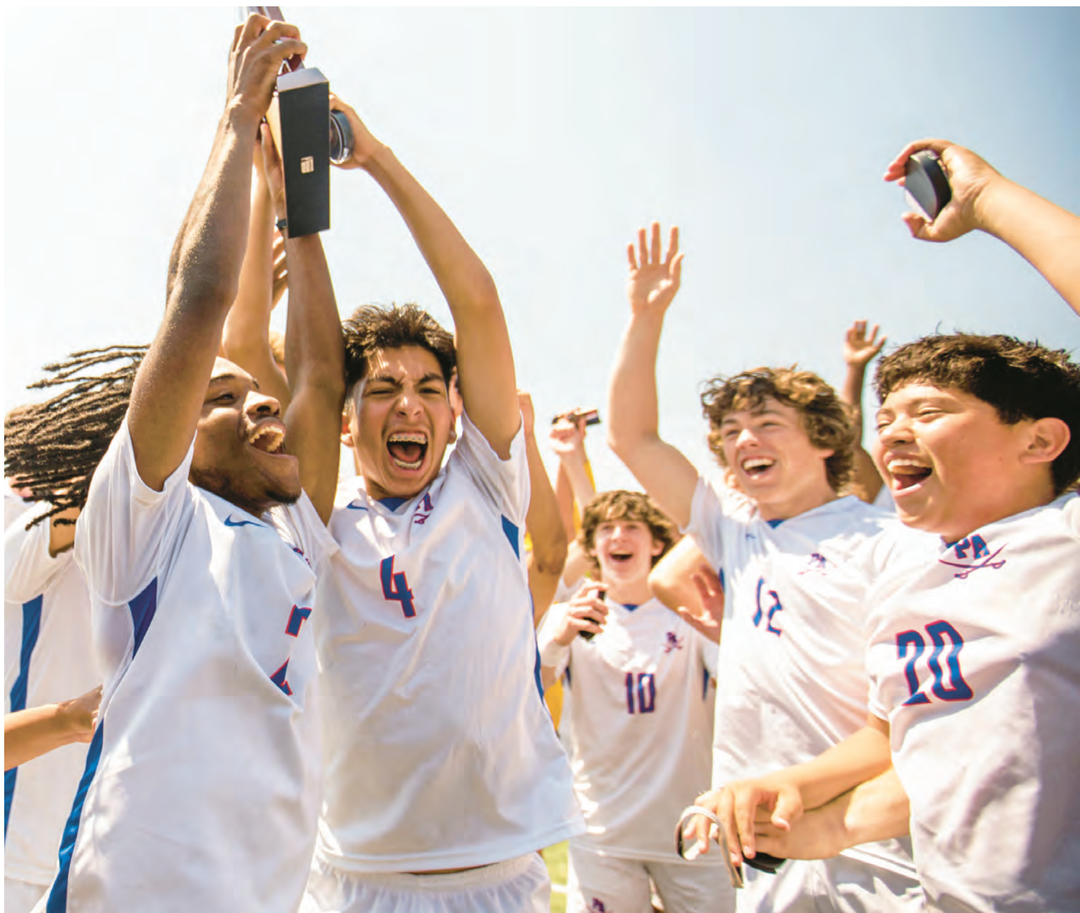
Princess Anne celebrates with the trophy after defeating Cox 3-1 Saturday to take the Class 5 state championship title at Riverside High School in Leesburg.