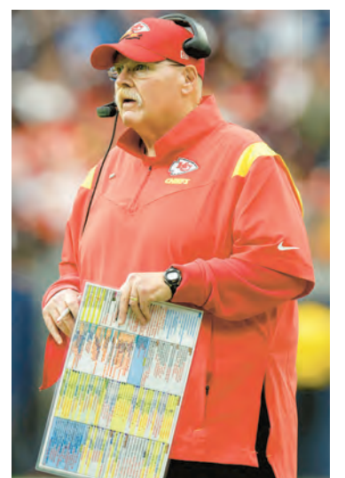
Kansas City Chiefs head coach Andy Reid has been in two of the past three Super Bowls. He never won a title in 14 seasons as Philadelphia's head coach.

Eagles All-Pro center Jason Kelce will become the first brothers to play each other in the Super Bowl. It'll be the first Super Bowl with two Black starting QBs. Also, Reid didn't retain now-Eagles head coach Nick Sirianni when he was an assistant in Kansas City in 2013. Turn to Super Bowl, Page 4