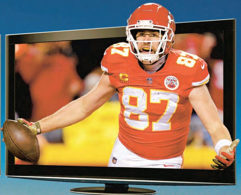
Illustration by Joe Kacik/Staff