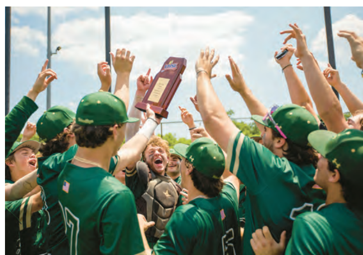
Cox players celebrate with the trophy after defeating Independence 8-0 to capture the Class 5 state baseball championship Saturday in Leesburg.