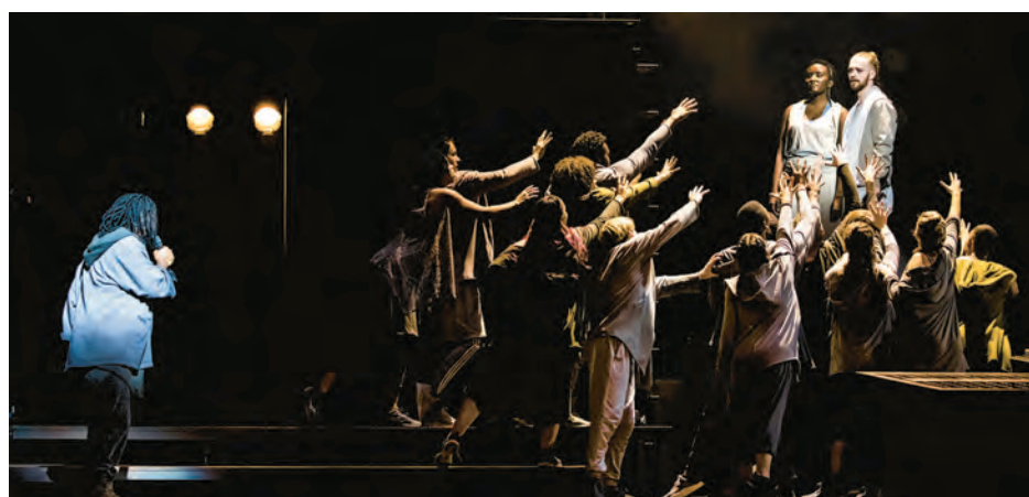
The North American tour company of "Jesus Christ Superstar."

The events have been the subject of passion plays for hundreds of years, including our work in question, by composer Andrew Lloyd-Webber (he of the megahits "Joseph and the Amazing Technicolor Dreamcoat," 1968; "Cats," 1981; and "Phantom of the Opera," 1986) and lyricist Tim Rice ("The Lion King,"