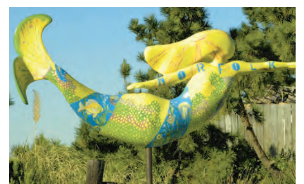
One of the mermaids that populate Norfolk: A New Horizon, in East Ocean View. On Saturday, Ocean View will host its new Mermaid Festival.