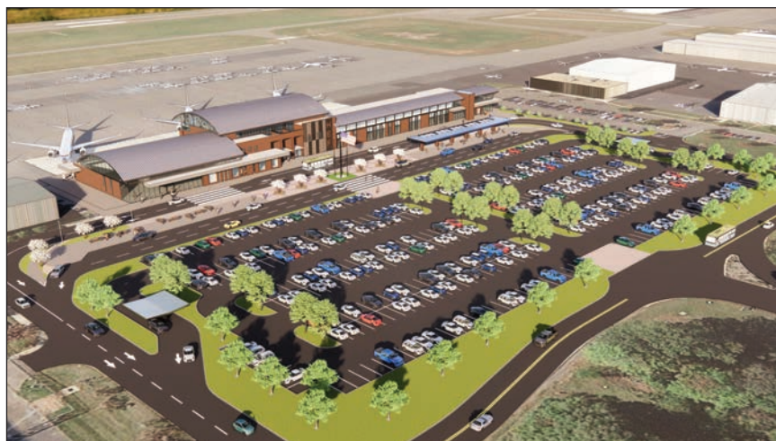
A rendering of a possible expansion at Manassas Regional Airport that could include commercial flights.