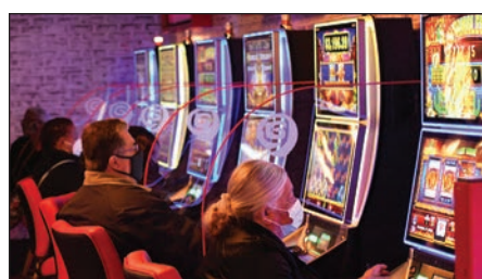
Bettors played historical horse-race machines during opening day at Rosie's Gaming Emporium in Dumfries in January 2021.

Trio of landmark projects may be coming to area