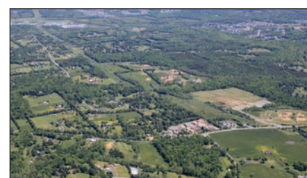
Sanders Lane, a four-mile road that runs between Sudley and Braddock roads near Gainesville, is located just north of Pageland Lane.