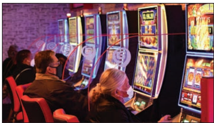
Bettors played historical horse-race machines during opening day at Rosie's Gaming Emporium in Dumfries in January 2021.

Trio of landmark projects may be coming to area