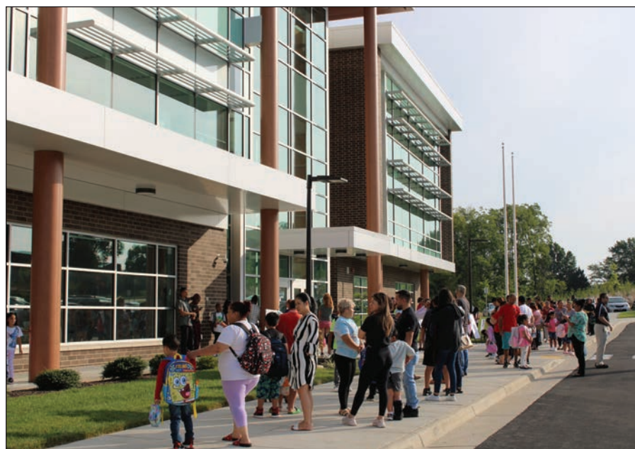
The new Innovation Elementary School, just outside of Manassas, welcomed students for their first day of school on Monday. Innovation is the county's first three-level elementary school.