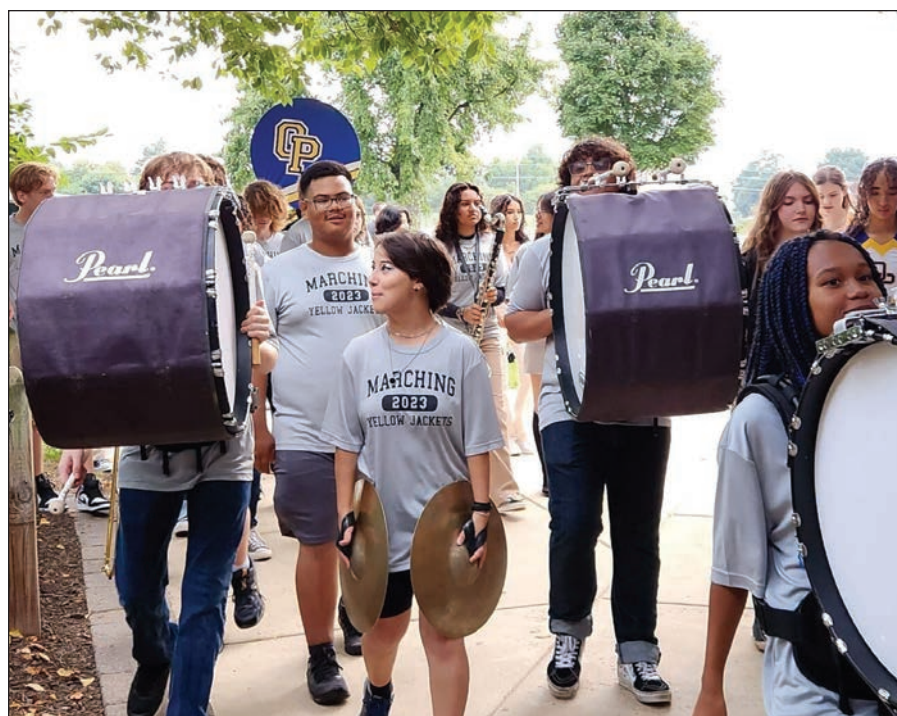
The Osbourn Park High School band was on hand for first-day festivities Monday.