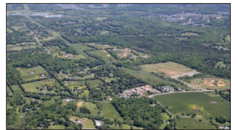
Sanders Lane, a four-mile road that runs between Sudley and Braddock roads near Gainesville, is located just north of Pageland Lane.