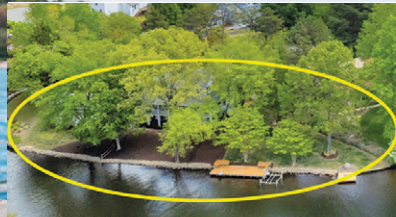
5 Old Mill Ct. SOLD $989,000 Represented the Sellers & Buyers