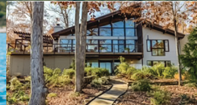
27 Amethyst Rd. SOLD $987,000 Represented the Sellers