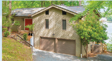
16 Bonita Rd. SOLD $689,000 Represented the Sellers