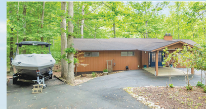
6 Swan Ct. SOLD $670,000 Represented the Sellers

We sold the 3 highest priced waterfront homes on record this year!