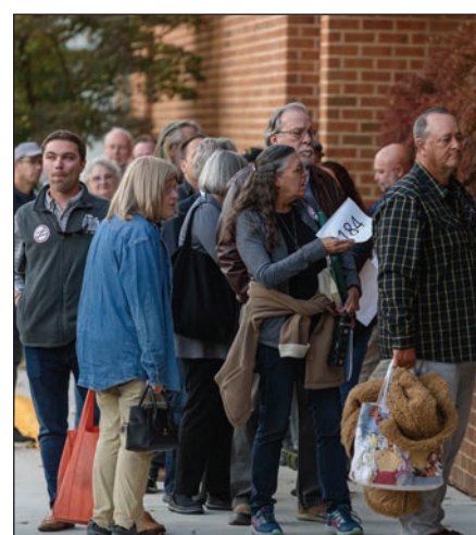
Local residents packed into the McCoart Administration Building Tuesday night before the PW Digital Gateway vote.