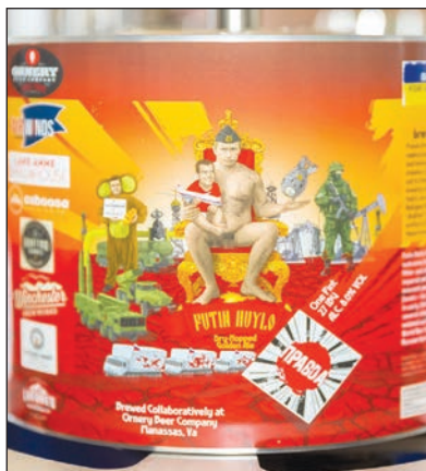
A roll of labels for Putin Huylo are applied to more than 3,000 beer cans at Ornerly Beer Company in Manassas, April 27, as a fundraiser for war-torn Ukraine.