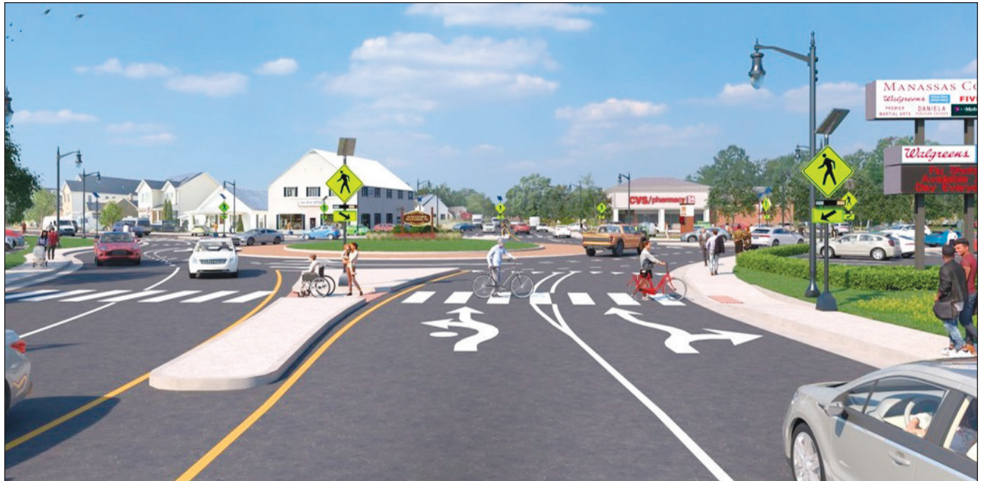
City of Manassas officials hope to transform the current intersection at Sudley Road, Centreville Road and Prescott Avenue just northeast of Old Town into a $3.8 million roundabout, with the goal of making it safer and quicker for motorists, pedestrians and cyclists.

To do so, the city has included the project in its RAISE grant application for the adjacent Mathis Avenue revitalization project aimed at beautifying and improv-