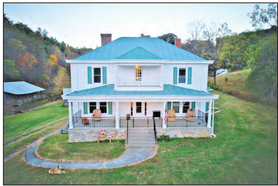
Shown are photos of the Inn at Maggodee Creek, which has a hidden pre-Civil War log cabin within its walls.

Vol. 38, No. 49 FAMILY OWNED AND OPERATED ©Womack Publishing Co., Inc. 2022