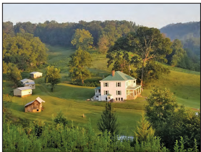
See CABIN , Page 9