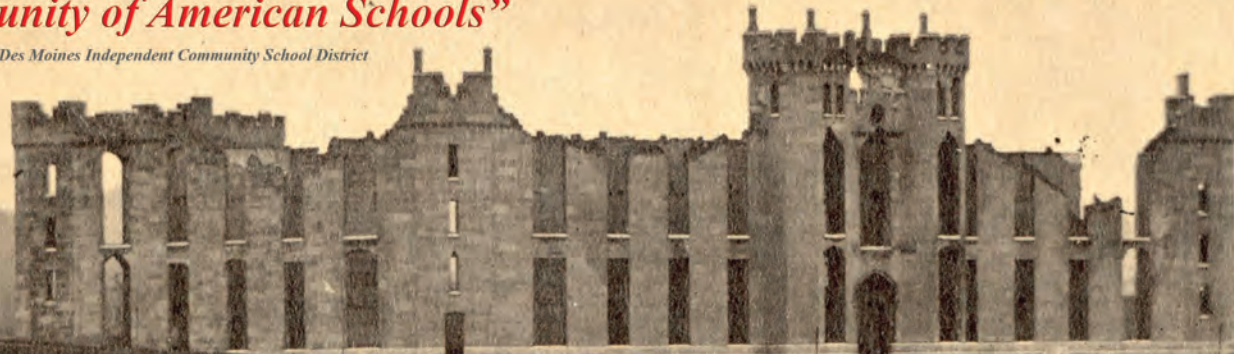
VMI barracks following Hunter's Raid in June 1864 during which precious documents from the library were also intentionally destroyed.

- Tinker v. Des Moines Independent Community School District