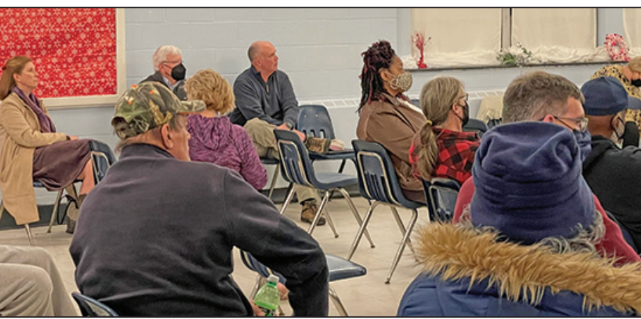
The crowd listened attentively as questions were posed and concerns were aired.