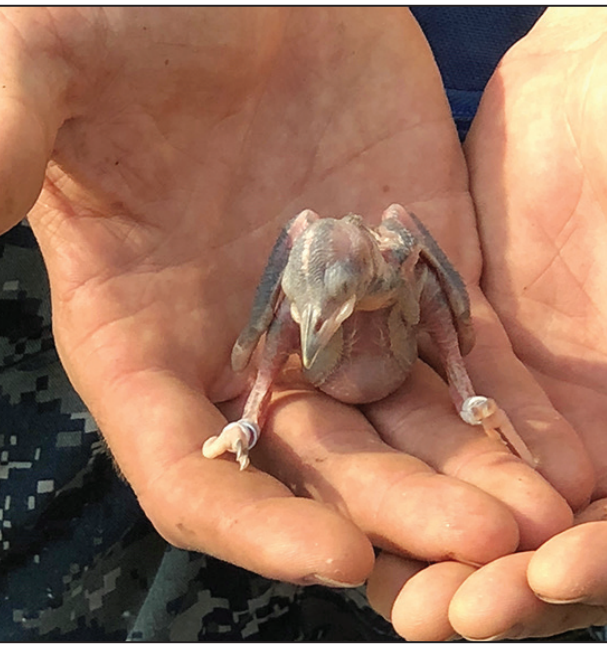
Carefully cradled in the hands of researchers when only a few days old, these alien-looking babies hold the key to the future of the species.