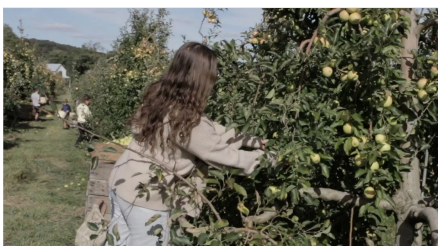
Community volunteers pick apples at Showalter's Orchard and Greenhouse on Thursday to save the apples before storm winds blow in over the weekend.

JANUARY 13, 2023 To help restaurants and the environment, some owners urge patrons to dine in, not take out