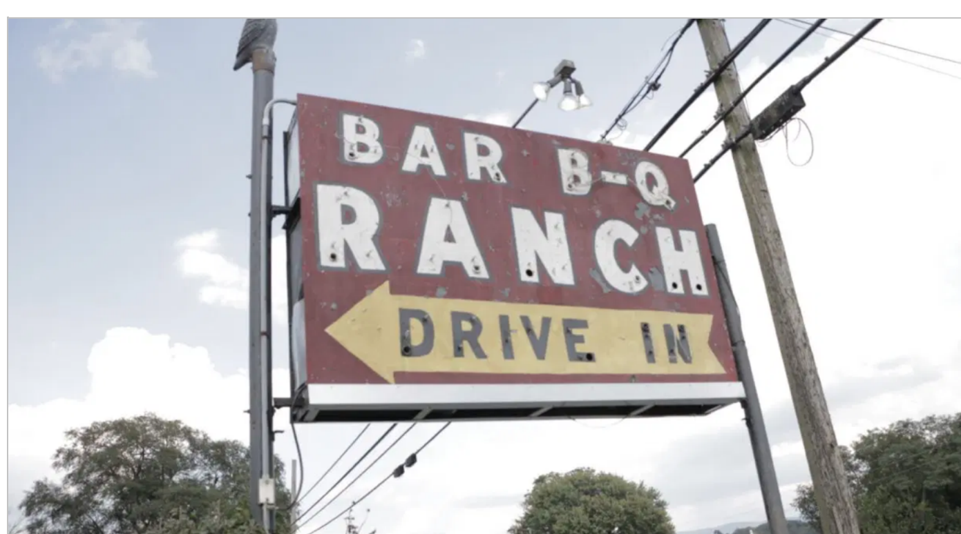
The Bar-B-Q Ranch north of Harrisonburg on Route 11 has been in business since 1947.

JANUARY 13, 2023 To help restaurants and the environment, some owners urge patrons to dine in, not take out