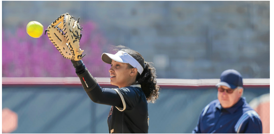
Smith takes a high throw to the bag.