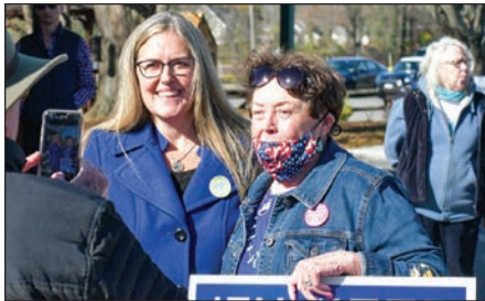
Incumbent Rep. Jennifer Wexton, shown here on Election Day in Warrenton, won a third term in Tuesday's election. Read the full story on Page 6.

In 10th District race, Prince William results include the county as well as the cities of Manassas and Manassas Park.