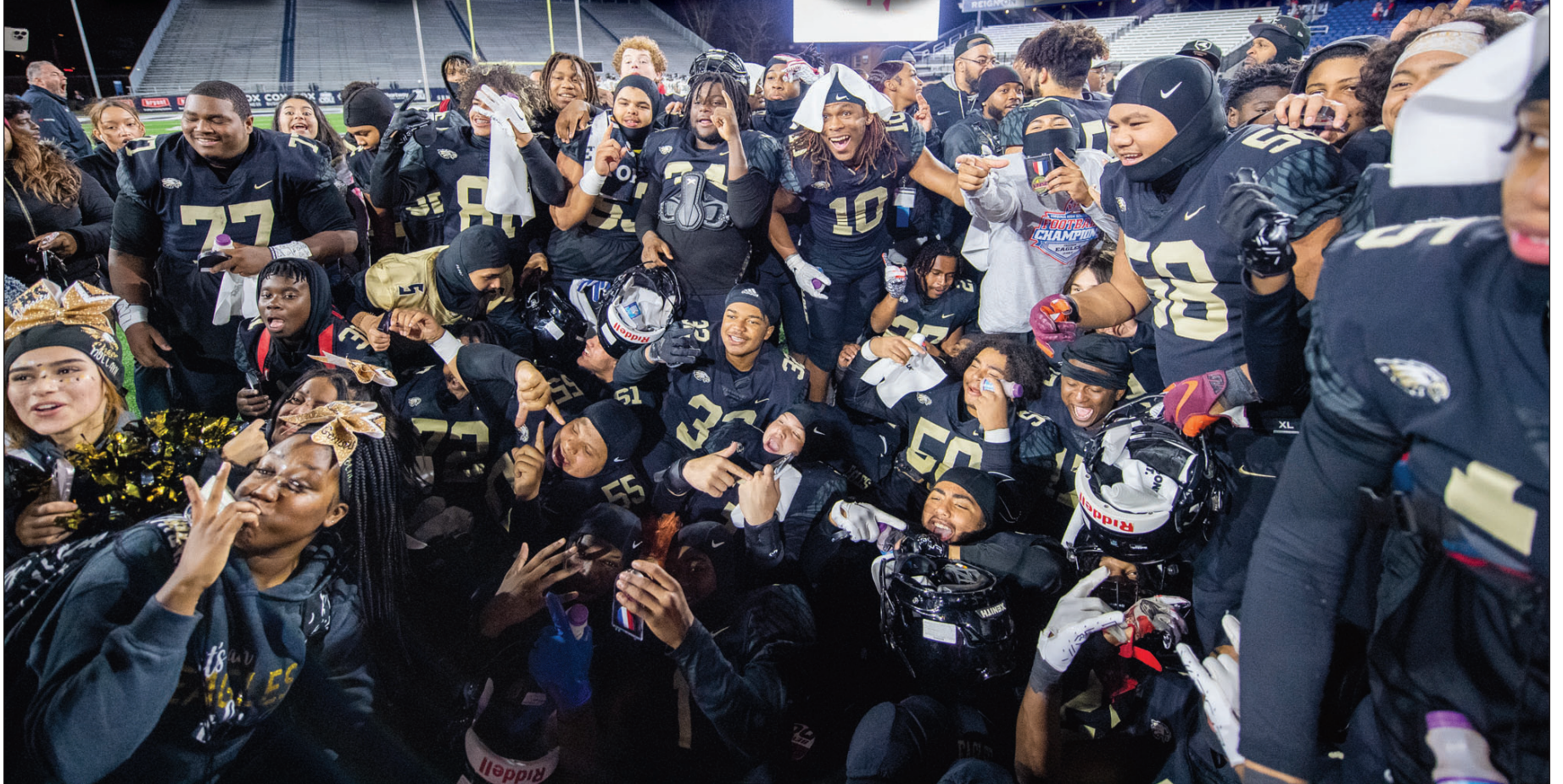
Freedom celebrates its Class 6 state title win Dec. 10 at Old Dominion University.