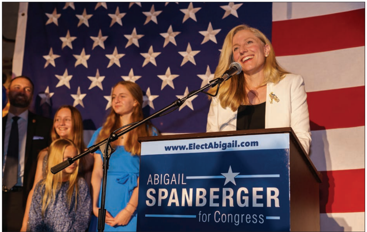
U.S. Rep. Abigail Spanberger celebrates her re-election in Virginia's 7th Congressional District during a victory party in Fredericksburg Tuesday.