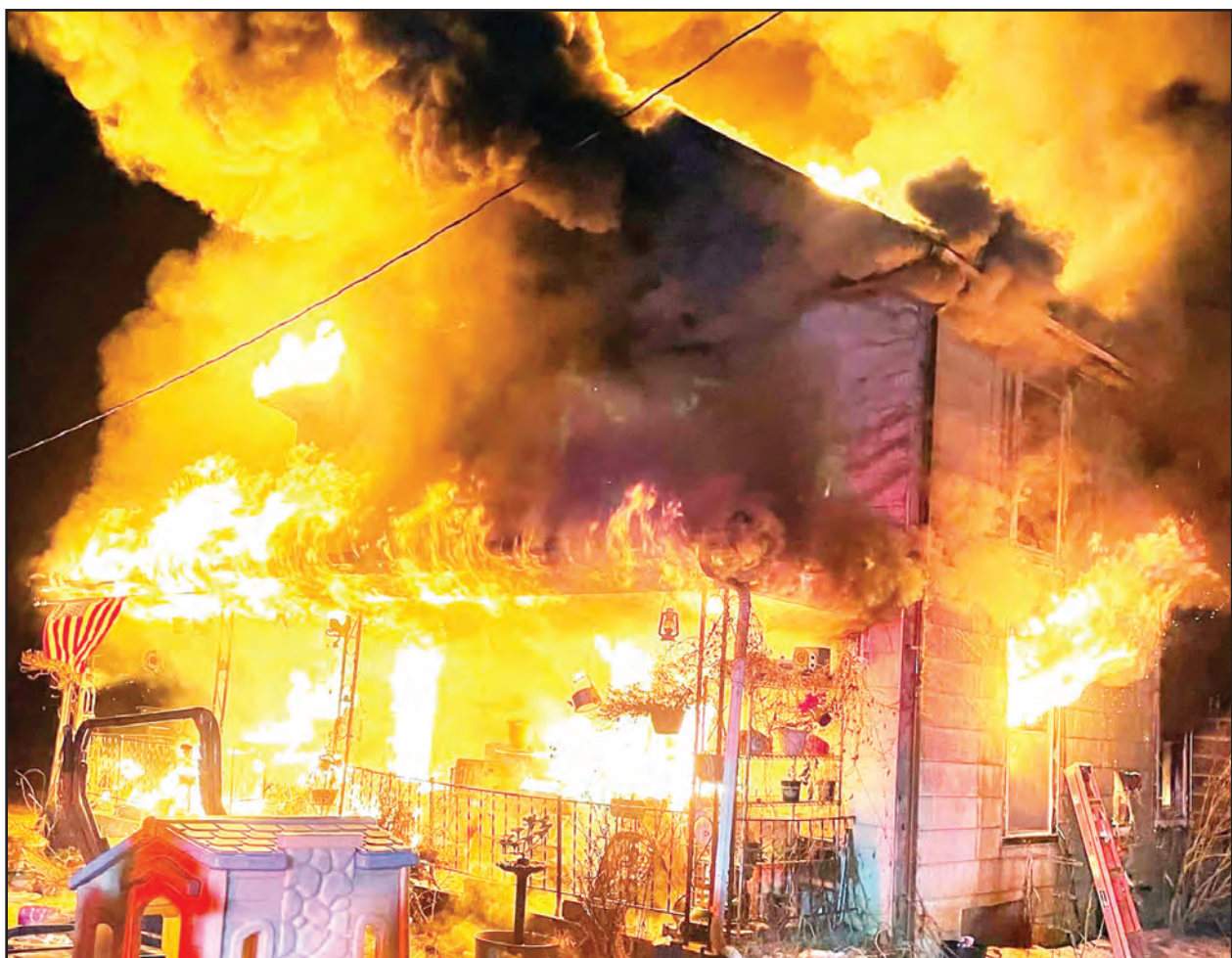
At right: A residential home on Winery Lane in Concord is destroyed by a fire around 8 p.m. Monday night. Nobody was injured in the blaze. Four fire crews arrived on scene.

Also assisting were the Monelison Fire Department, Pamplin Fire Department and the Concord Rescue Squad.