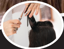
Hair Cuts and Styling