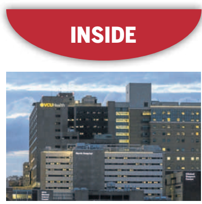
VCU HEALTH HALTS TACTICS » VCU Health ends campaign that took patients' wages, put liens on homes, A2