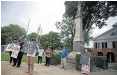
CONFEDERATE STATUE CRISIS » Caroline supervisors must decide where to relocate monument, A2

The policy stated students See TRANSGENDER, Page A6