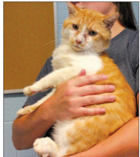
Chimmy Changa: Male Domestic House Cat 3 Years old