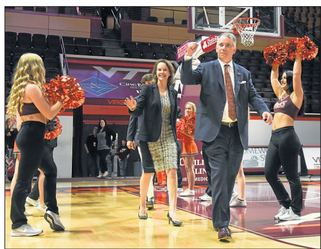
THE ROANOKE TIMES