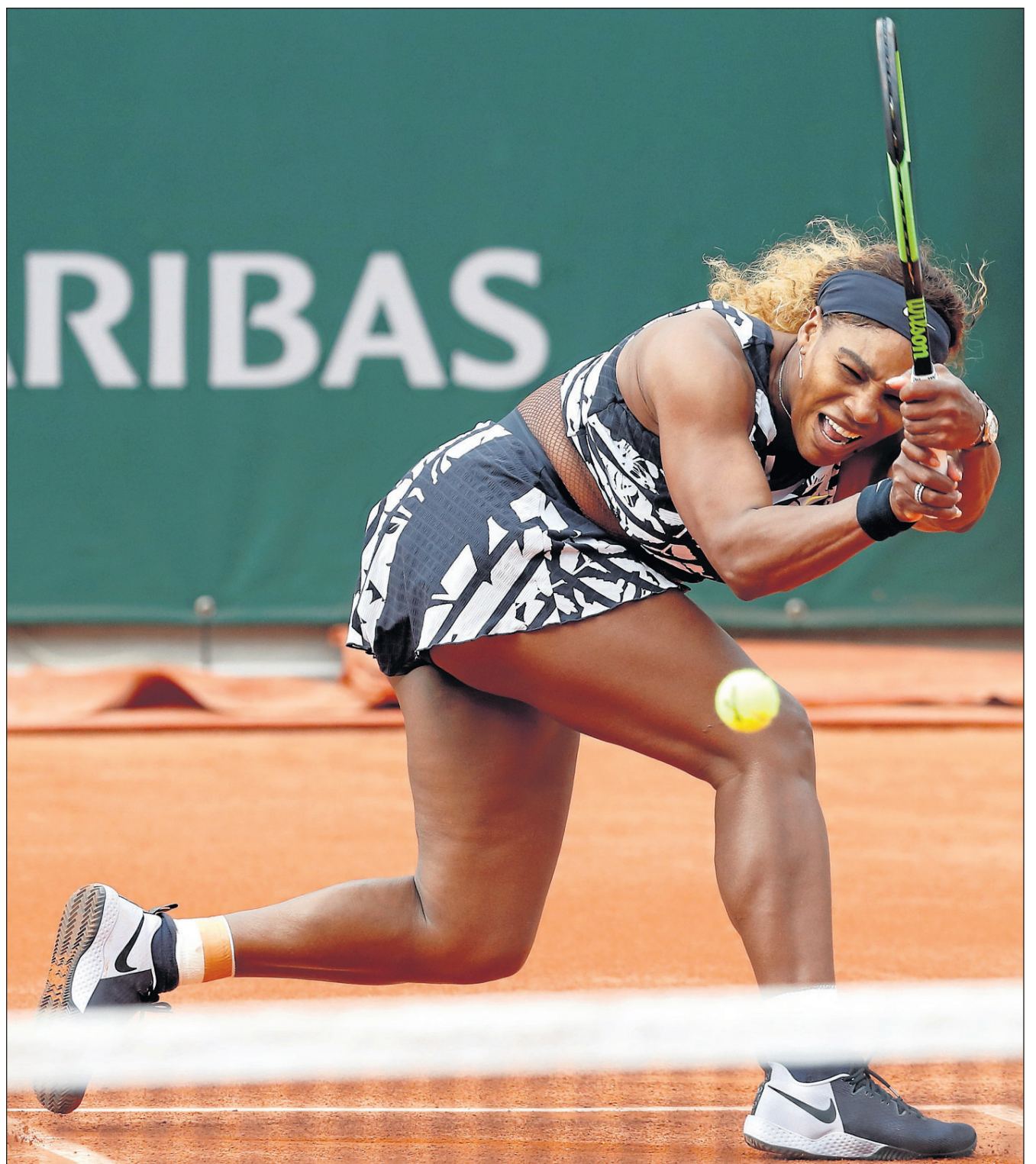
Serena Williams plays a shot against Vitalia Diatchenko, of Russia, during their first-round match of the French Open on Monday.