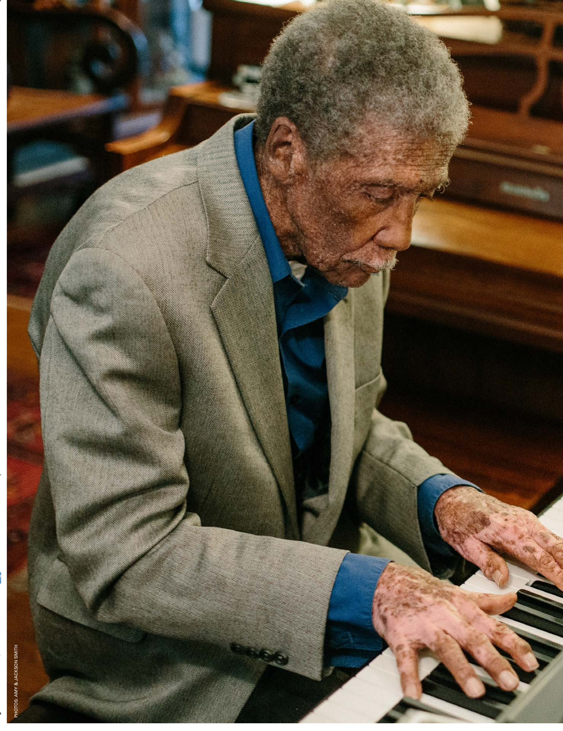
September 18 – 24, 2019 c-ville.com