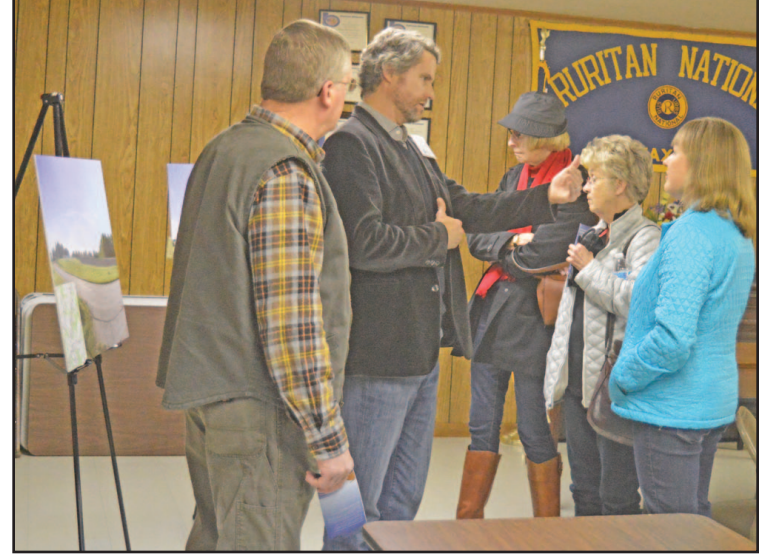
Representatives from Open Road Renewables met with the Climax community on Monday night to discuss a proposed solar farm.