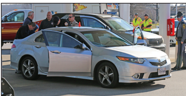
Police searched this car during the investigation at Circle K.

Law enforcement officials from Pittsylvania County and the Virginia State Police gather information from a crime scene Tuesday at the Circle K gas station in Blairs.