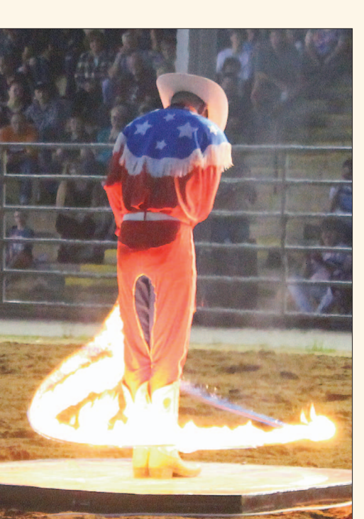
MORE PHOTOS ON PAGE 4A