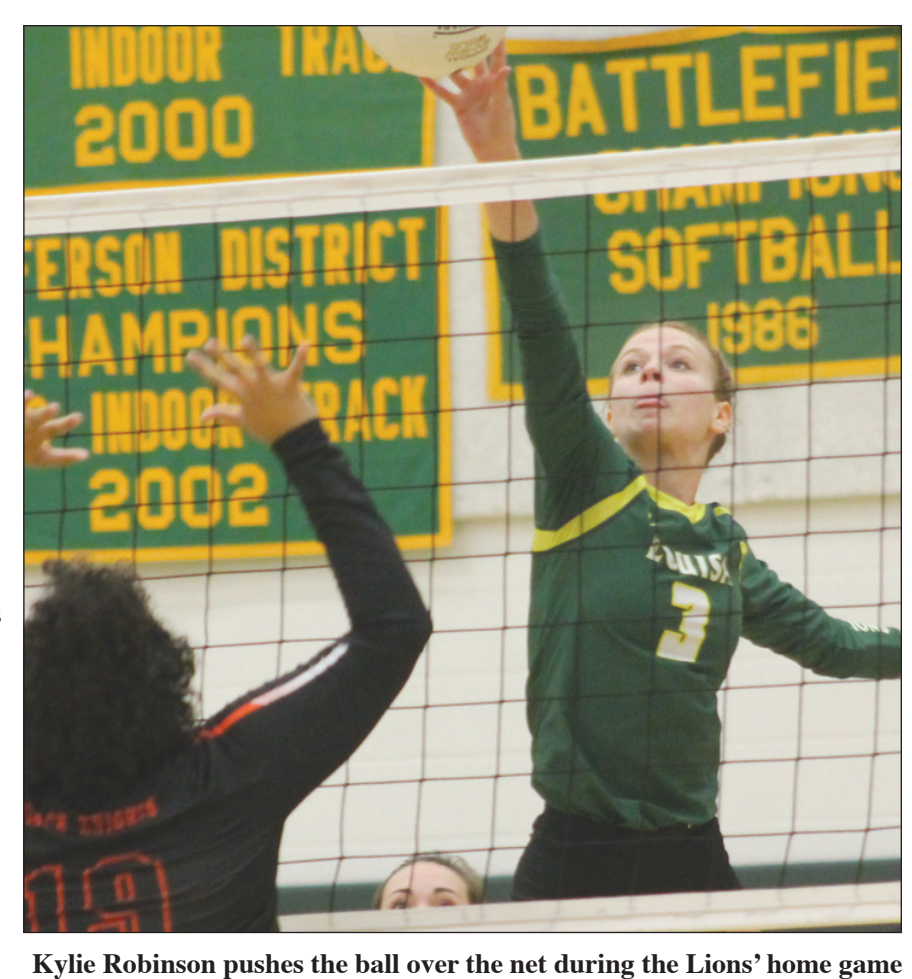
against the Charlottesville Black Knights on Oct. 3.