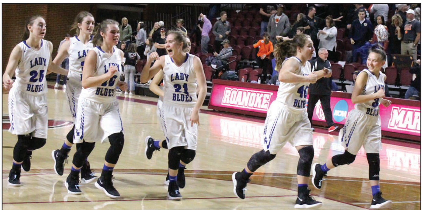
THE BLUES' players happily celebrate their victory as they jog off the court.