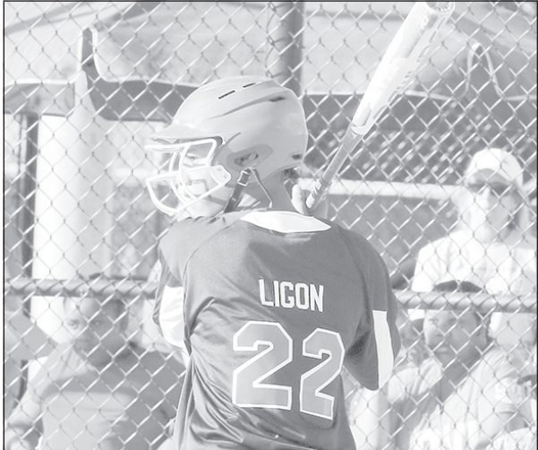
TITUS MOHLER | HERALD

The PEFYA boys reached the final three in the five-team district tournament by eliminating the Charlotte