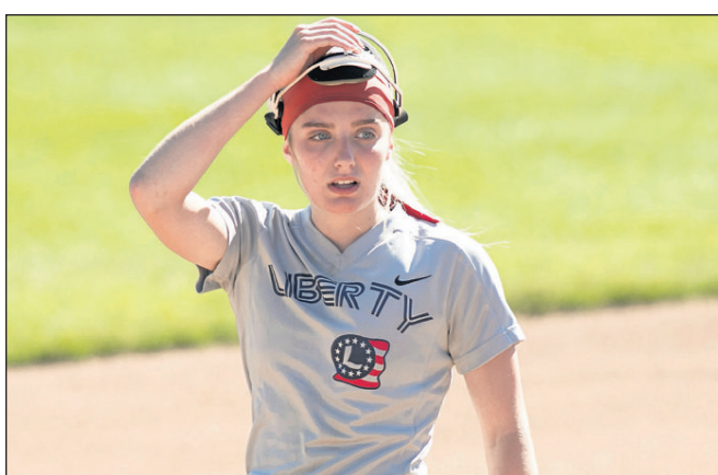
Taylor reacts after committing an error against Turner Ashby.

Taylor committed five errors, all within the first four