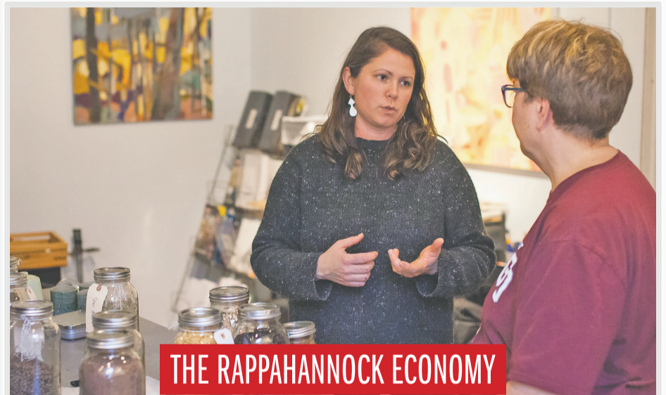
THE RAPPAHANNOCK ECONOMY