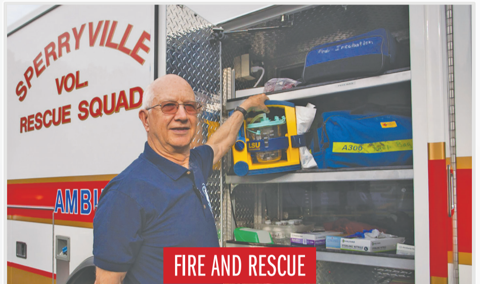
FIRE AND RESCUE