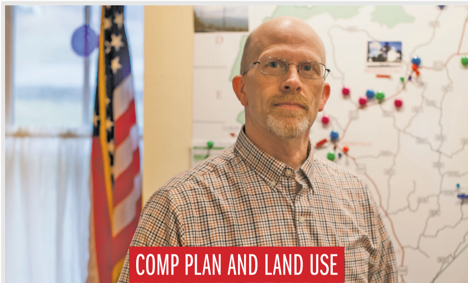
COMP PLAN AND LAND USE