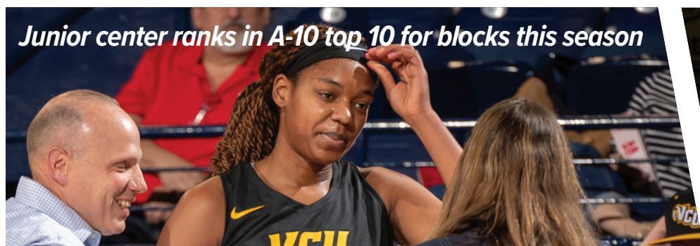
Junior center ranks in A-10 top 10 for blocks this season