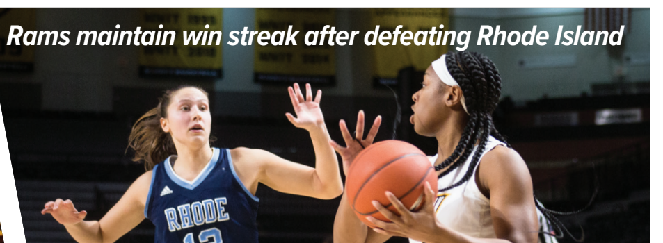
Rams maintain win streak after defeating Rhode Island