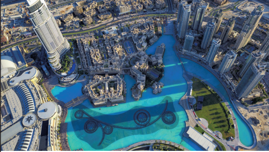
Dubai & Oman • Dates: February 1-11, 2020