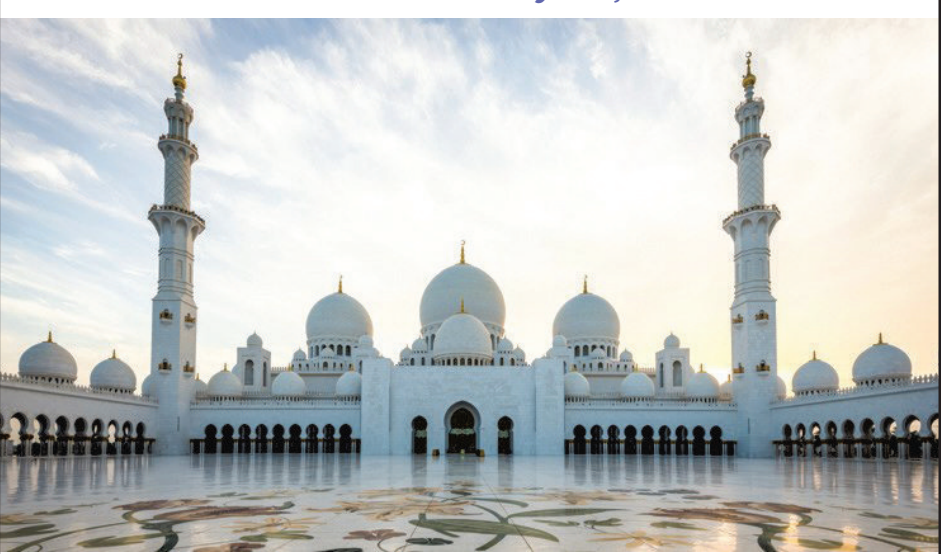
Dubai & Oman / 11 Days • February 1-11, 2020